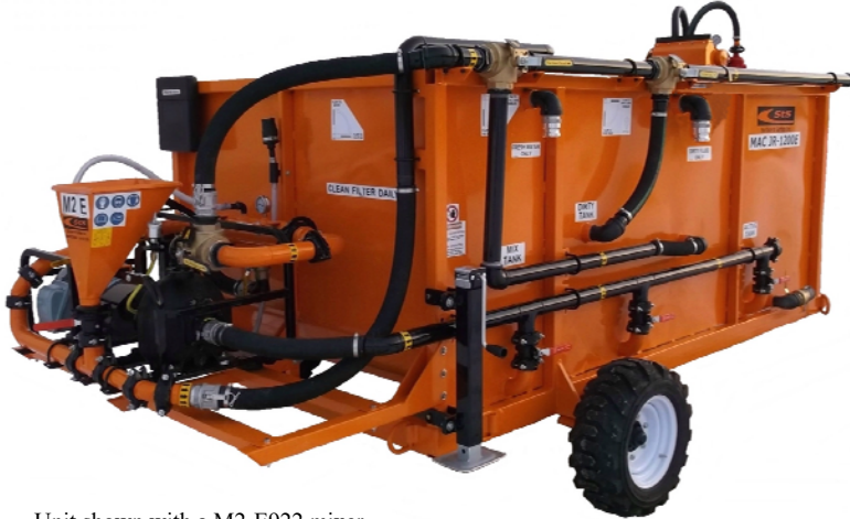
Unit shown with a M2-E922 mixer