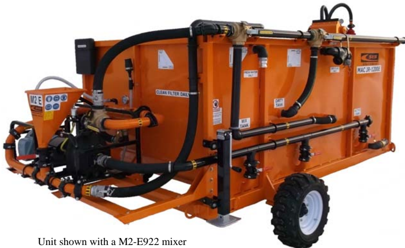
Unit shown with a M2-E922 mixer